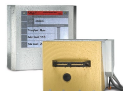
Videojet IP DataFlex Plus TTO

Videojet IP65 and IP66 rated coders are designed for washdown environments and utilize superior 316 grade stainless steel. Contact Videojet to discuss your variable coding needs today.